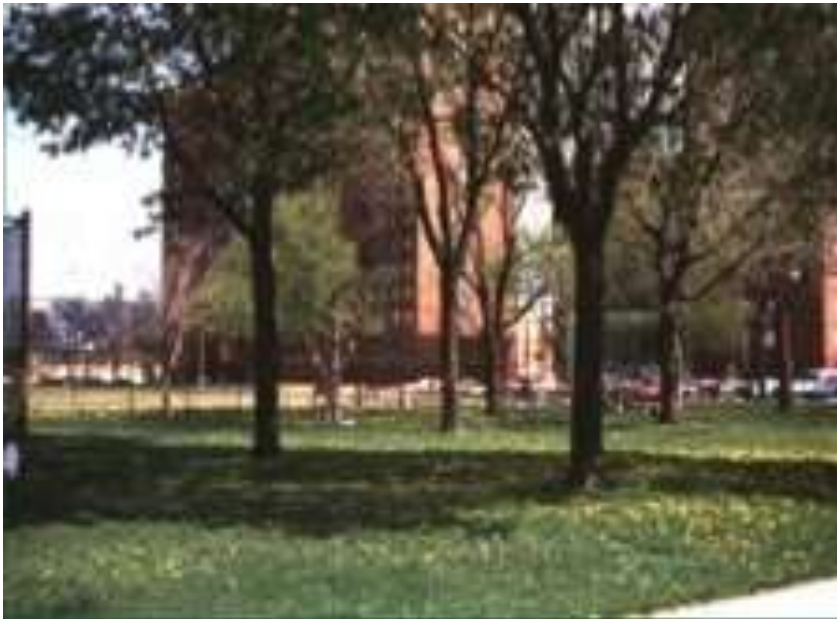
Robert Taylor Homes with greenspace