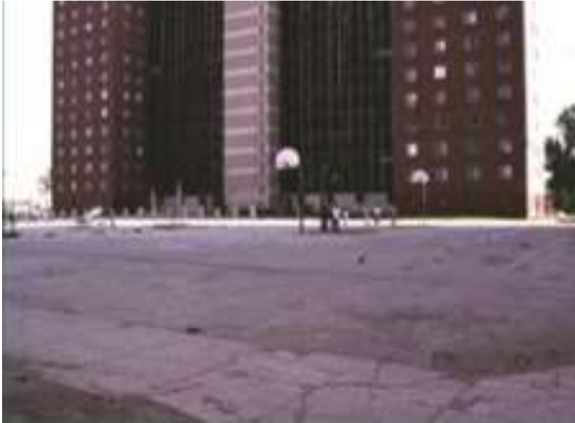
Robert Taylor Homes without greenspace