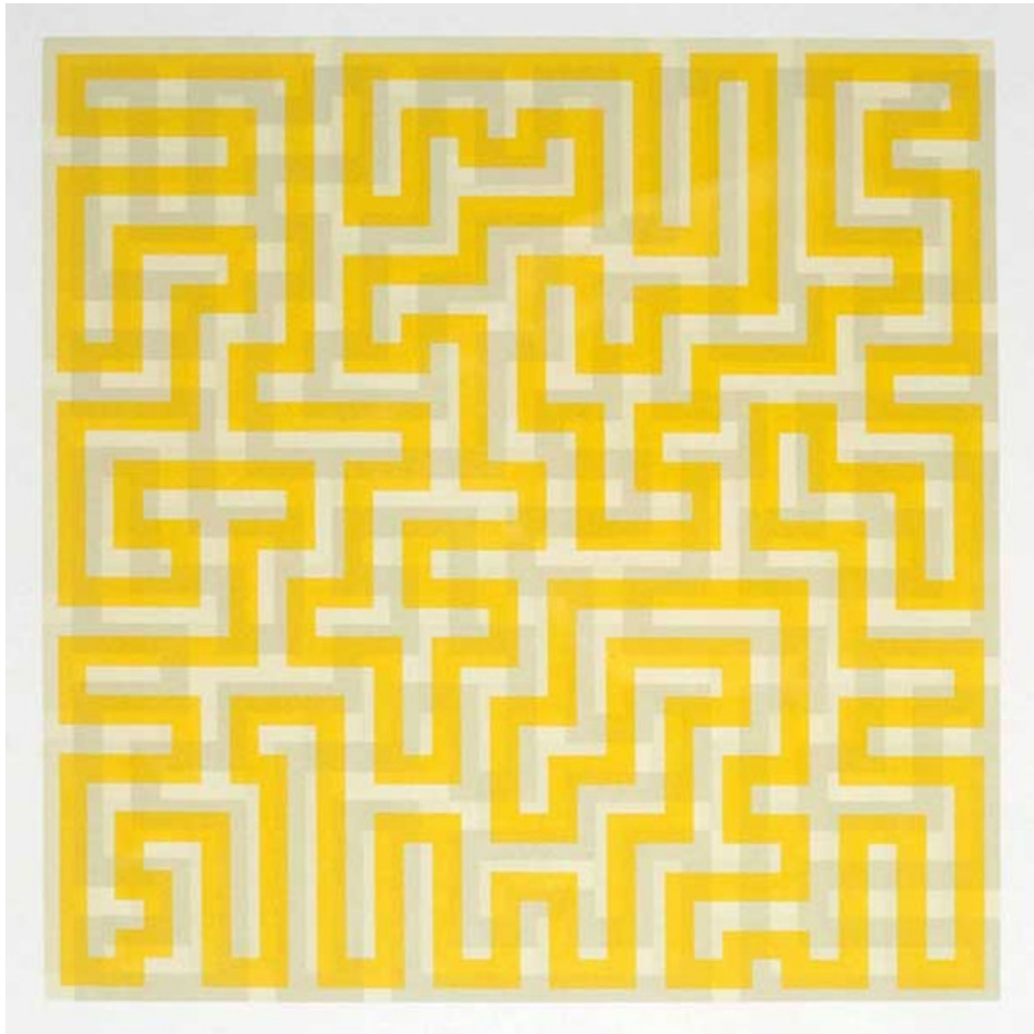
Yellow Meander by Anni Albers