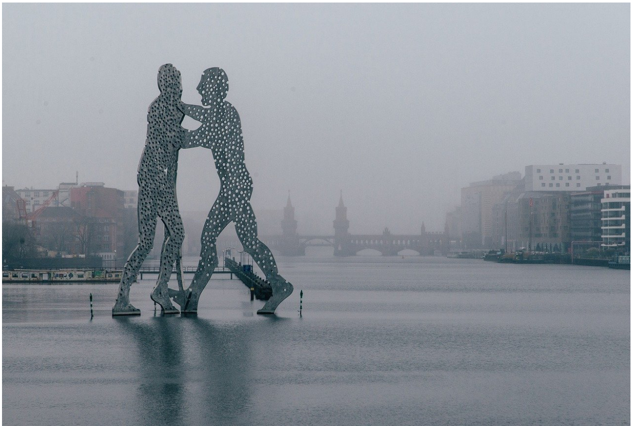
Molecule Men, Berlin.