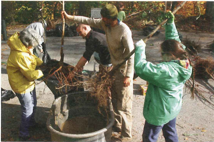
LEFT Volunteers dip bare-root trees into a hydrogel slurry and then bag the root system to protect it from drying out.