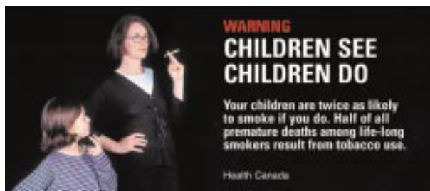
Figure 4 Canadian package warning label warning parents about their own smoking behaviour.

messages stressing the negative health consequences of smoking create fear among smokers, and that such messages may be more effective when presented in tandem with recommendations for how the negative consequences can be avoided. 6,26 Thus, labels that provide information about quitting could enhance the effectiveness of not only the current set of warning labels that focus exclusively on negative health consequences, but also future warning labels that would focus on enhancing people's efficacy to quit. For example, the new Canadian warning labels include quit tips, efficacy messages, and a website for obtaining additional information about methods of quitting.