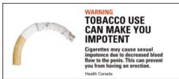
Figure 3 Canadian package warning label directed at young males.

The social psychological literature points out that it is important not only to identify which attitudes and beliefs are important for a given group, but also the underlying reasons for those attitudes and beliefs. 38 Research in this area focuses on the important question: what are the underlying functions for holding particular attitudes? Attitudes fulfil various functions, and understanding the function of the attitude provides insight into the types of messages likely to have impact. 39, 40