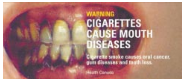
Figure 1 Canadian package warning label that may invoke fear.

It should be noted that this research on framing cannot be used to conclude that gain-framed messages are effective and loss-framed messages are not. Rather, it suggests that gain-framed messages may be more effective in certain settings than loss-framed messages. A second qualifying comment is warranted here. The research on framing does not conclude that gain-framed messages are superior to loss-framed messages when the gain-framed message covers a different topic than a loss-framed message. For example, it cannot predict that a gain-framed message such as "you'll experience greater self-esteem if you quit smoking" will be