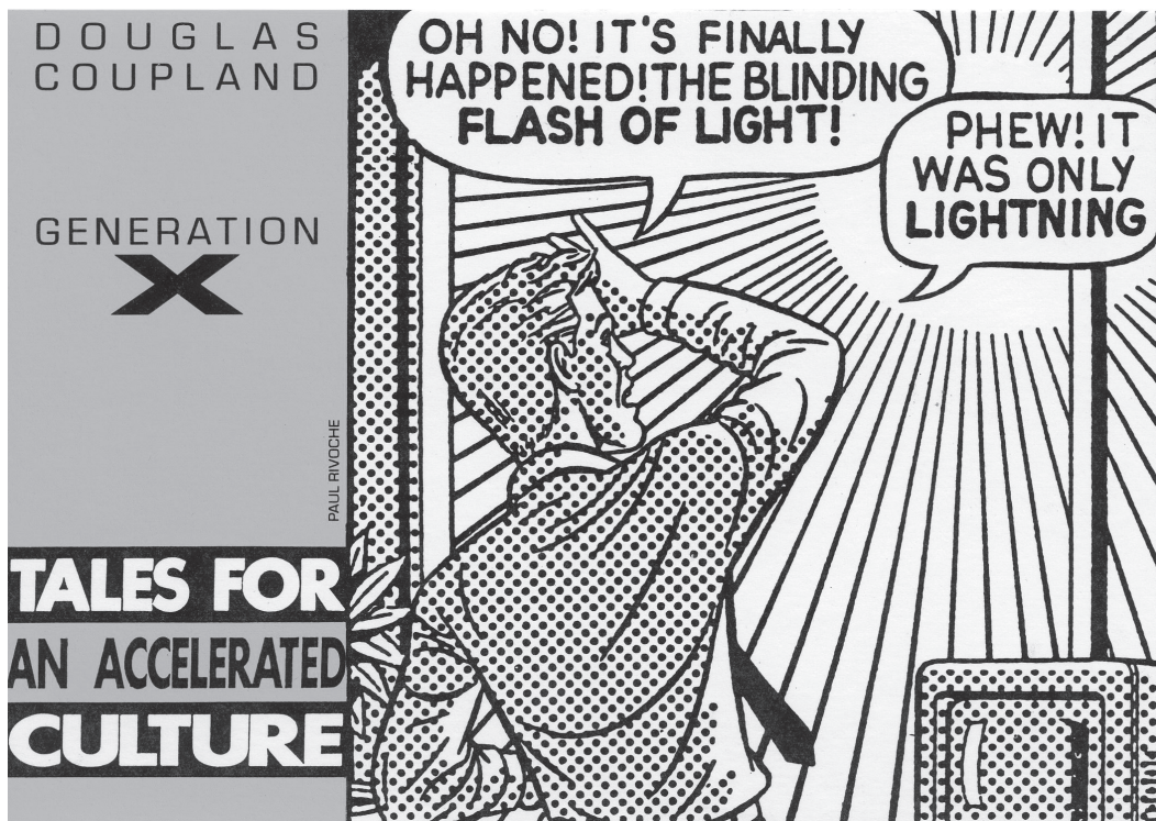
A promotional card for Generation X. This is not only evidence of the promotion and marketing of the book, but also an example of Coupland ephemera for collectors to examine.

of drafts of major works). As one might predict based on Coupland's diverse and interdisciplinary work, the Douglas Coupland fonds contains many elements that one would perhaps not expect in an author's archive. The documentation is equally reflective of Coupland as an artist and designer as it is of Coupland as an author.