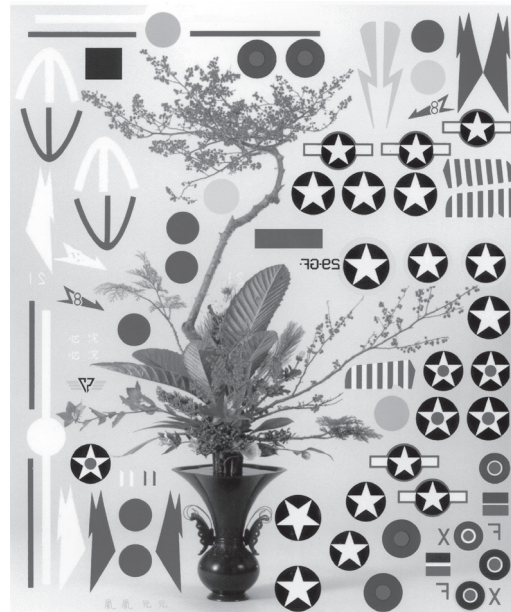
The cover art for Coupland's Miss Wyoming shown in conjunction with one of many digital collages from the archive, many of which appeared on Coupland's website. There are striking similarities between some of Coupland's book covers and these digital collages; similar aesthetics also appear in other works of art.

list of files according to the series arranged by the archivist or in the literal original order as it was physically transferred to the library.