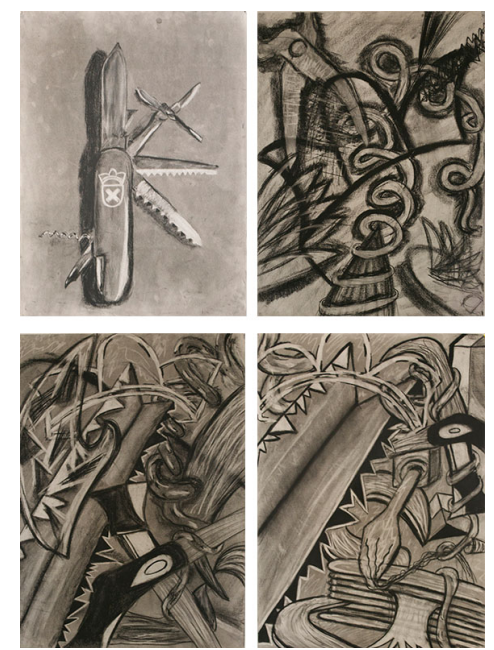
Figure 1. Abstracted Swiss Army Knife (Kelsey Fritsch, https://kelsey4142.wordpress.com/drawing-i/)