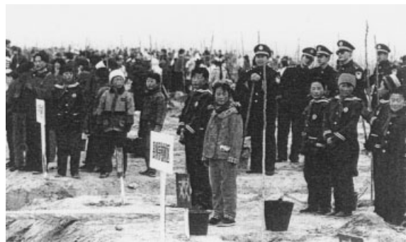
Figure 3. Tree planting festival in Shenyang (March 1999).

In China, as in many other countries, success in promotion of an environmental project like ours