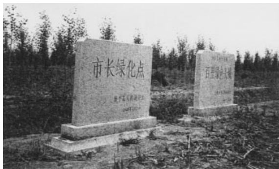
Figure 4. Tree plantation and two monuments (September 2000).

on-going Japan–China joint research project which provides support for adoption as a CDM of our newly developed product, biobriquette, and related activities such as afforestation in Shenyang.