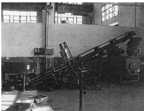
Figure 1. The sign for the joint Japan–China biobriquette experimental factory (above) and the biobriquette manufacturing machine (below).