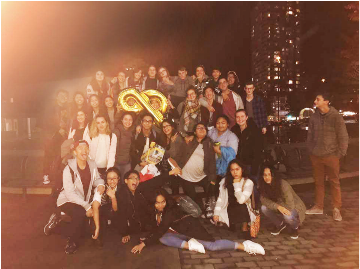
A photo of me and my friends from high school that met again recently to hang out.