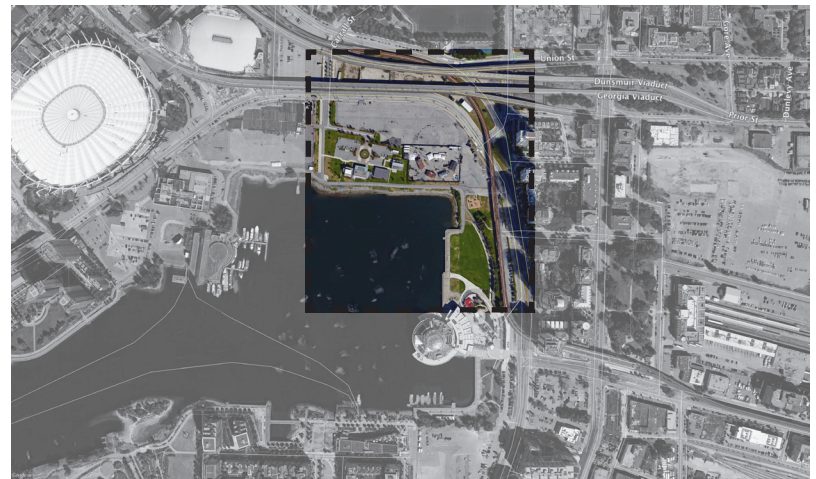
NE False Creek

Location: Between 16th and King Edward Avenue, Yew and Maple Street