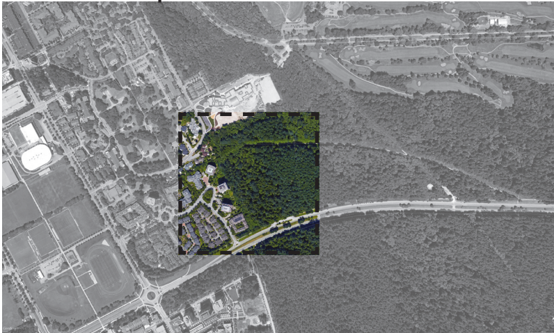
Pacific Spirit Park