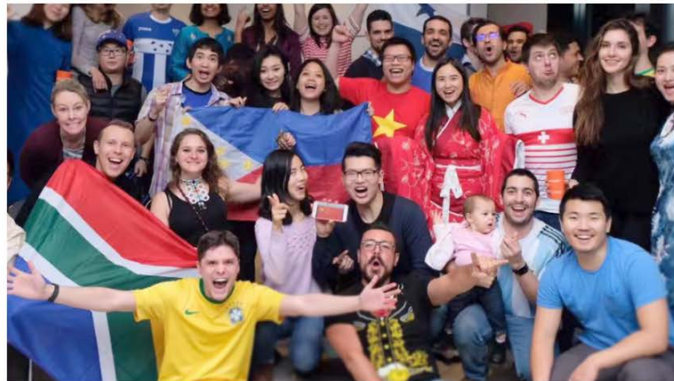
Join classmates from throughout the Global Network for Advanced

Get more information and connect with admissions