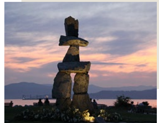
Inukshuk at English Bay in Vancouver. Photo by Christina Chan. Released under CC BY 4.0.