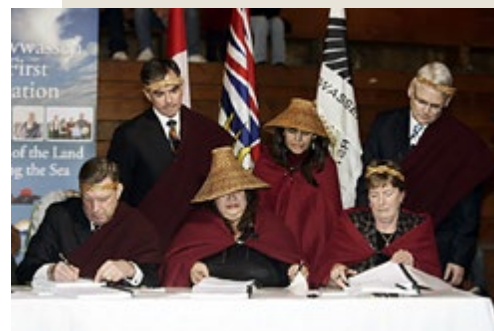
Signing the Tsawwassen Final Agreement, 2006.