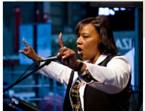
Walk for Reconciliation, September 22, 2013.