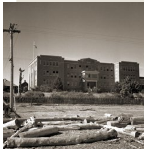
View of Indian Residential School in Alert Bay. Date unknown.

One of the largest class action suits in Canadian history was settled in 2007. It resulted in the establishment of the Residential Schools Settlement and payment of $1.9 billion. This settlement made several promises. It gave more funds to the Aboriginal Healing Foundation (now closed) for healing programs in communities, 13 and offered payments to survivors as reparation. Reparation payments are compensation for past wrongs endured by the victims. The Residential Schools Settlement also set up a process in which survivors could be granted more money if they could prove particular abuses, and provided funds for commemorative projects. The settlement included a government apology made in the Parliament in 2008 by Prime Minister Stephen Harper on behalf of the federal government. It also established the Truth and Reconciliation Commission . You can read about the Truth and Reconciliation Commission in Chapter 12 .