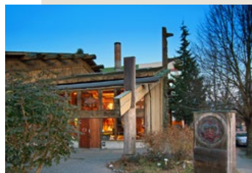
NEC Native Education College: BC's largest private Aboriginal college.

Community partners hosted 12 cultural exchange visits. First Nations, Aboriginal, and immigrant community members visited different sites as guests. For example, the Musqueam and Tsleil-Waututh Nations each hosted a visit. For many participants, this was their first time in a First Nations community. There were visits with the Ismaili, Jewish, and Chinese communities, and the Vancouver Aboriginal Friendship Centre, Native Education College, and the UBC First Nations Longhouse and Museum of Anthropology also welcomed guests. In these exchanges, hosts shared their knowledge of their communities and invited participants to see special places and join in activities.