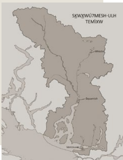
Map of Squamish Territory. Created by OldManRivers for Wikimedia. Released under CC-by-2.0

“Our society is, and always has been, organized and sophisticated, with complex laws and rules governing all forms of social relations, economic rights and relations with other First Nations.”