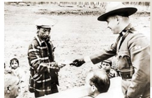
Royal Canadian Mounted Police representative handling treaty paper to Ocheise man, Rocky Mountain House, Alberta. c. 1948. Courtesy Glenbow Archives. NA-1954-5

In Canadian law, Aboriginal title and rights are different than the rights of non-Aboriginal Canadian citizens. Aboriginal title and rights do not come from the Canadian government, although they are recognized by it. They are rights that come from Aboriginal people's relationships with their territories and land, even before Canada became a country, and from Aboriginal social, political, economic, and legal systems that have been in place for a long time. 8