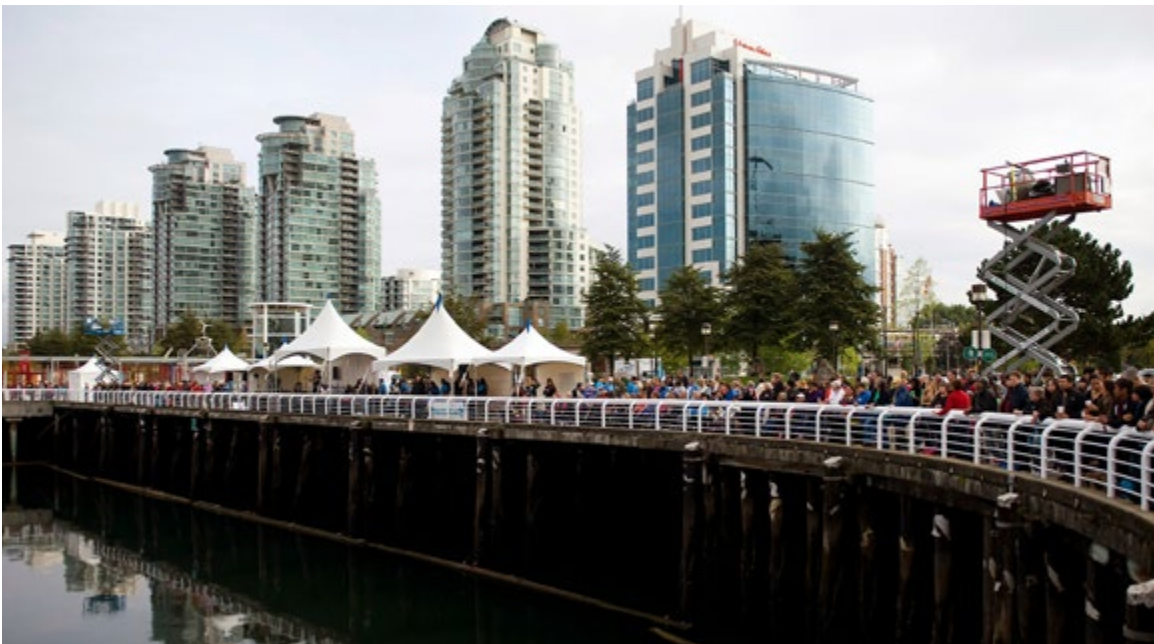
Walk for Reconciliation, September 22, 2013.