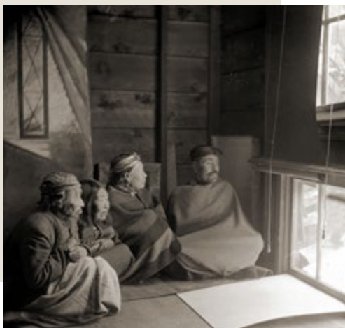
Group of four Kwakwaka'wakw elders, seated, clothed in blankets, c. 1900s. Accession no. 71740

People repeat stories orally to keep information alive over generations. 8 Particular people within each First Nation have memorized oral histories with great care for accuracy. 9 While everyone knew some history, not everyone was a historian. 10