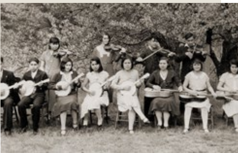
Alberni IRS orchestra, c. 1930.

When they arrived, the staff took away the children's clothes and cultural belongings. The children's hair was cut and they were required to wear uniforms of Euro-Canadian clothing. Children did not get enough food and lived in poor quality buildings that were hot in the summer and cold in the winter. The overcrowding and malnutrition meant that