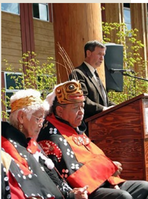
10 th Anniversary celebration of the Nisga’a Final Agreement, 2010.

Tsawwassen means “land facing the sea.” The Tsawwassen First Nation is located on the Strait of Georgia near the Tsawwassen ferry terminal,