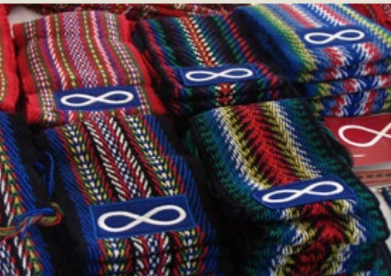
Métis sashes.

The most well-known Métis people are from the Red River region of what is now Manitoba. They lived in and used this region's land before it became a part of Canada. 19 They developed a culture that combined First Nations and European cultures, yet were also independent from them. 20 Louis Riel was a famous leader of the Red River Métis in late 1800s. He led two resistance movements against the Canadian Government for Métis people's rights to the land. 21 Government recognition of Métis rights continues to change, and, in recent years, major legal decisions have continued to affect them.