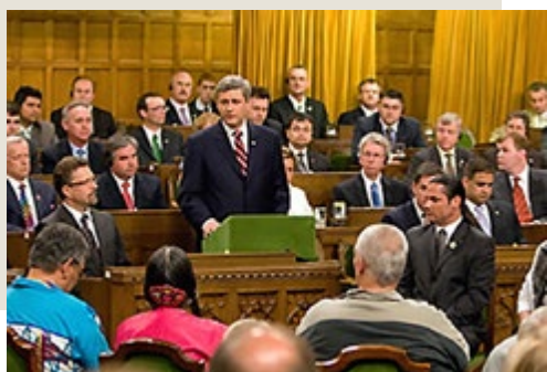
Prime Minister Harper offers full apology on behalf of Canadians for the Indian Residential Schools system, 2008.

To the approximately 80,000 living former students, and all family members and communities, the Government of Canada now recognizes that it was wrong to forcibly remove children from their homes and we apologize for having done this. We now recognize that it was wrong to separate children from rich and vibrant cultures and traditions that it created a void in many lives and communities, and we apologize for having done this. We now recognize that, in separating children from their families, we undermined the ability of many to adequately parent their own children and sowed the seeds for generations to follow, and we apologize for having done this. We now recognize that, far too often, these institutions gave rise to abuse or neglect and were inadequately controlled, and we apologize for failing to protect you. Not only did you suffer these abuses as children, but as you became parents, you were powerless to protect your own children from suffering the same experience, and for this we are sorry..."