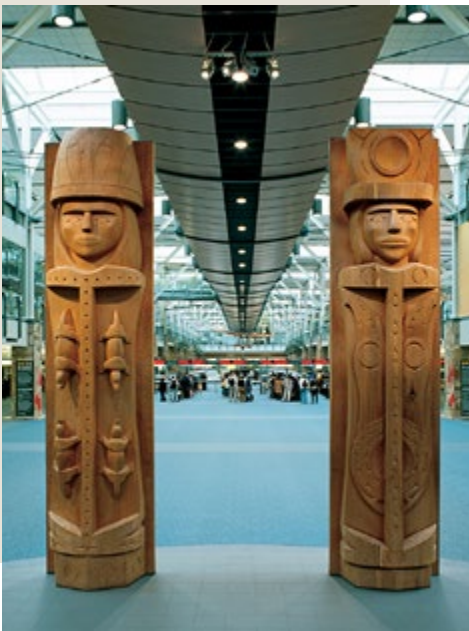
Susan Point, Musqueam, Female and Male Welcome Figures (1996).

The name x w məθk w əy’əm (Musqueam) means “People of the River Grass.” The story of their name has been passed on from generation to generation. It says that, like the River Grass, the Musqueam people have periods in which their population grows and shrinks.