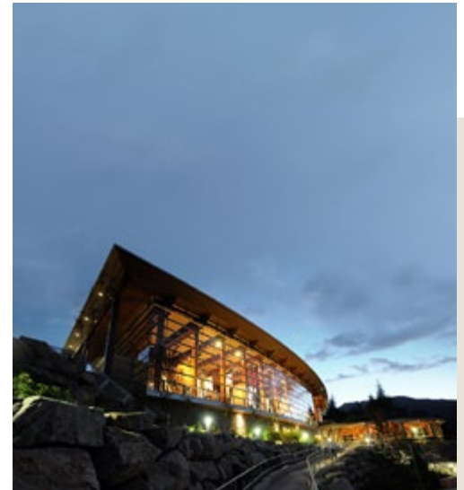
Squamish Lil'wat Cultural Centre in Whistler BC.

Some Vancouver place names used today are English versions of Aboriginal words. Often these Aboriginal words were not place names. Naming places after faraway places or people who have never lived there is a European, not Aboriginal, custom. Some examples of local or BC Aboriginal names and words used as Vancouver street names are: Capilano, Cheam, Comox, Haida, Musqueam, Nootka, and Sasamat.