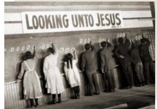
Students at the blackboard, Red Deer Institute, Alberta c.1914. Courtesy of the United Church Archives, Toronto. 93.049P/850N

Many also found it hard to fit into Euro-Canadian society. They had a low level of education and faced racism and discrimination when they tried to find work. Unable to fit into community life and not accepted in mainstream society, some did not feel that they belonged anywhere.