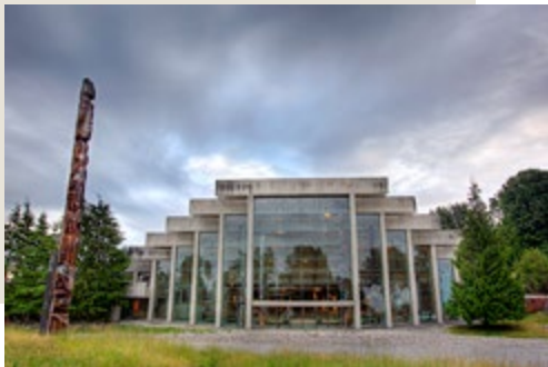
Gulf of Georgia Cannery.