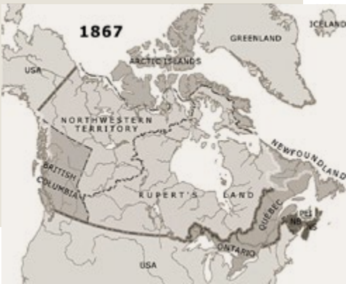
Map of the Dominion of Canada in 1867.

Aboriginal resistance to the Indian Act is supported by many international human rights organizations: Amnesty International , the United Nations , and the Canadian Human Rights Commission have called the Indian Act a human rights abuse. 27