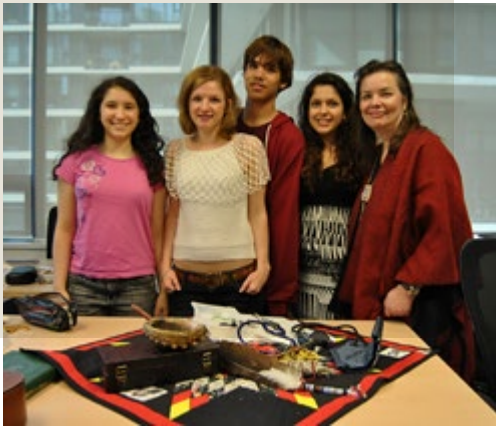
Youth and Elders PhotoVoice project group.