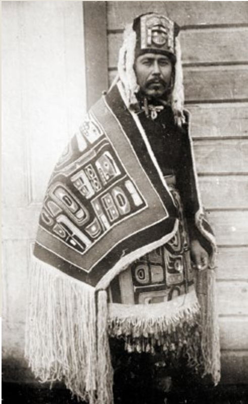
Nisga'a chief in feast robe, 1902. Accession no. 2675

With the formation of the Government of Canada, the ways of life for all First Nations were changed forever. The government developed policies that forced a system of “band” governance on First Nations so that they could no longer use their own system of government. A band is a community of First Nations people whose membership is defined by the Government of Canada. Many bands now have an elected council, called a “Band Council,” and an elected chief . Traditionally, some First Nations leadership was hereditary, and was passed down through the generations. Today many First Nations still have systems of hereditary leadership. Some bands continue to recognize their Hereditary Chief in their Band Councils, in addition to their elected Chief, but others do not. 4 Today band councils are responsible for administering the education, band schools, housing, water and sewer systems, roads, and other community businesses and services for their First Nations members. 5 There are 203 First Nations bands in BC, 6 and 614 in Canada. 7