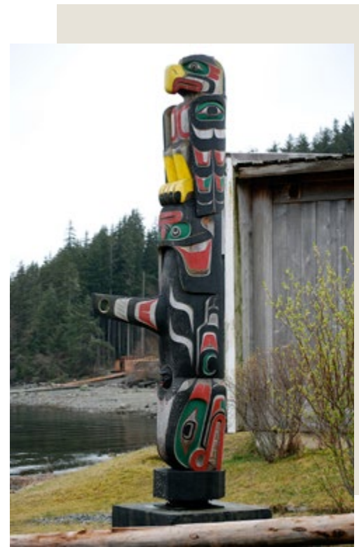
Totem pole at Alert Bay.

A potlatch is a formal ceremony used by First Nations on the north-west Coast of North America. The Potlatch is the essence of the culture as it is the cultural, political, economic, and educational heart of the nation. A potlatch may be held to recognize and celebrate births, marriages, deaths, settle disputes, totem pole raising, giving cultural names, passing on names, songs, dances, or other responsibilities, or formalizing aspects of relations between families or communities. 14 Potlatches are large events that can last several days. They often include two important aspects: the host giving away gifts and the recording, in oral history, of the events and arrangements included in the ceremony. Potlatches are also a way to redistribute wealth as