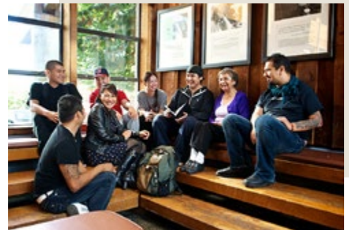
Students speaking with an Elder in the fireplace lounge of the NEC Native Education College.

"The Aboriginal Friendship Centre means a lot to me because I have so many different friends here now. I get really lonely sitting at home all by myself. People from all different places come here. They've got Métis people, Cree people, and people from all up and down the coast. It just seemed like I fit right in and I started doing everything that I'm doing right now..."