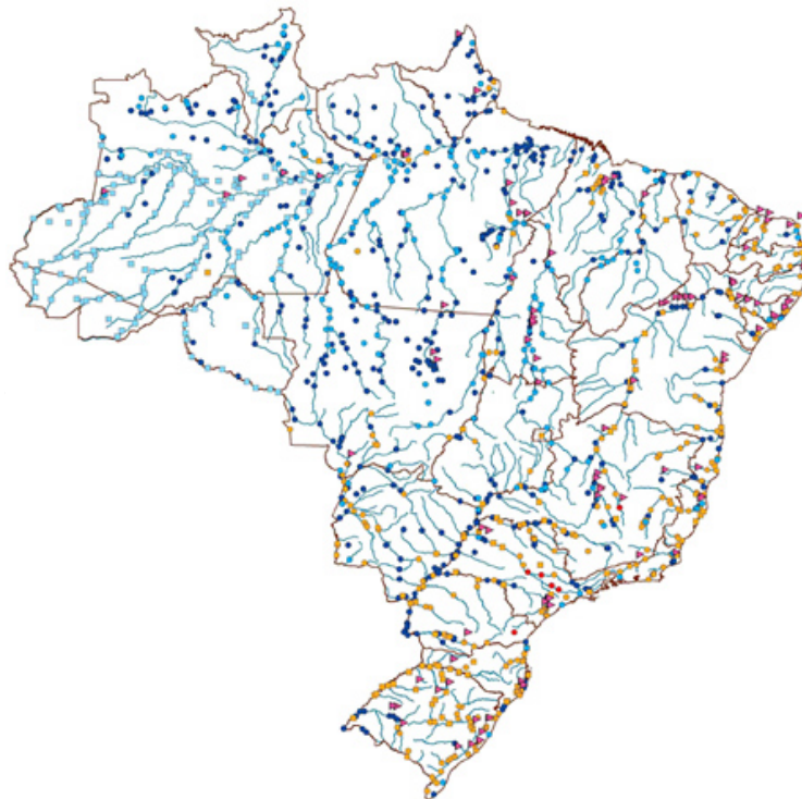
Figure 2. Water quality of Brazilian rivers; from pristine (light blue) to heavily impacted (red); tributaries in the Southern Amazon shows a slight degradation, that this is generally not observable a downstream is due to the ecosystem services provided by riparian habitats (adapted from Moss and Moss 2009).

Wetlands and other Amazon forest ecosystems have multiple ecosystem functions, such as mediating water flows and acting as sinks for sediments and urban effluents ensuring that downstream populations enjoy steady clean water supplies. The Amazon has 12.5% of the world's fresh water, while it is one of the most pristine of all the major river basins in the world. The purity of the water in the Amazon and its tributaries is the consequence of the vast natural filter provided by its natural ecosystems for the sediments, nutrients and pollutants that are washed into the rivers by innumerable farms, mines, villages, and cities. The relatively pristine state of the waters of the Amazon was recently validated by a systematic effort to study water quality in the rivers of Brazil (Figure 2); while these studies demonstrate that most of the watershed remains pristine, there are localized areas that have been impacted by human effluents (Moss and Moss 2009). The cost of these services are difficult to know due to the “veracity” of the civil engineer's antiquated paradigm for dealing with pollution (e.g., the solution to pollution is dilution); the vast quantity of the water in the Amazon as yet masks the economic impact of its degradation.