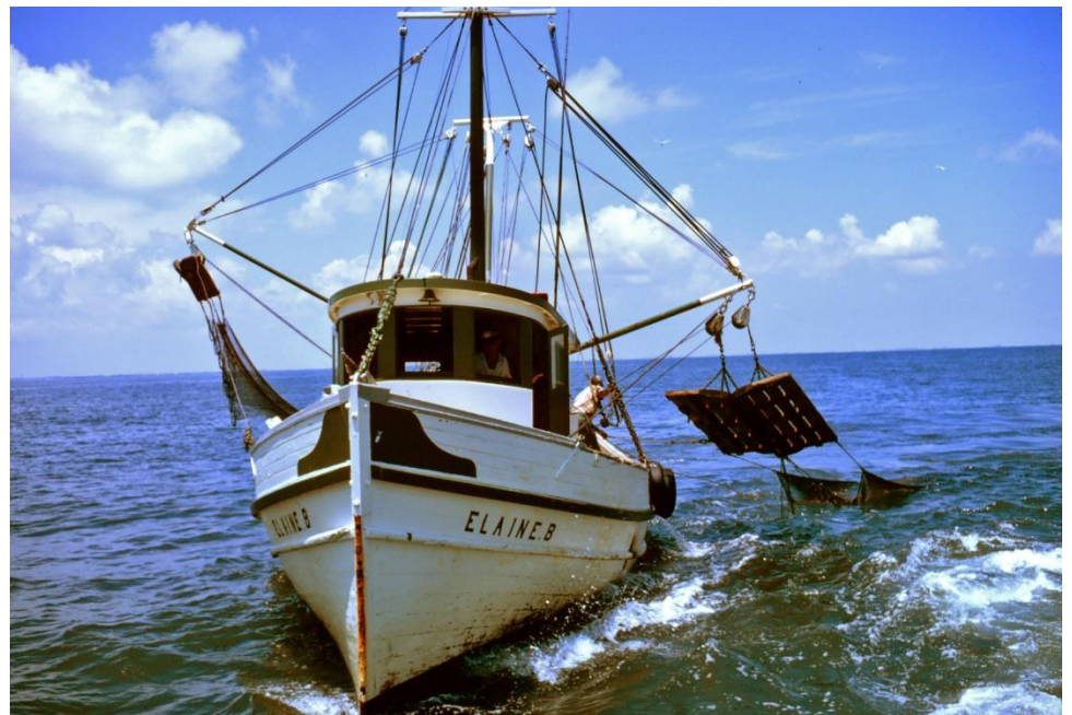
Trawler hauling nets (double rigging). Using heavy metal doors.

Bottom trawling is one of the most destructive forms of commercial fishing. Heavy metal doors are used to hold open a net that is used to catch commercial seafood. The doors dig into the ocean bottom and are dragged along causing large, deep grooves that tear up the seafloor. A recently released report determined that 59% of the 727 Marine Protected Area's (MPA) created by the European Union are being bottomed trawled. The purpose of an MPA is to protect sensitive marine ecosystems and to allow marine biota to increase in diversity and population size. Bottom trawling activity in MPA's is in direct conflict with the purpose of an MPA.