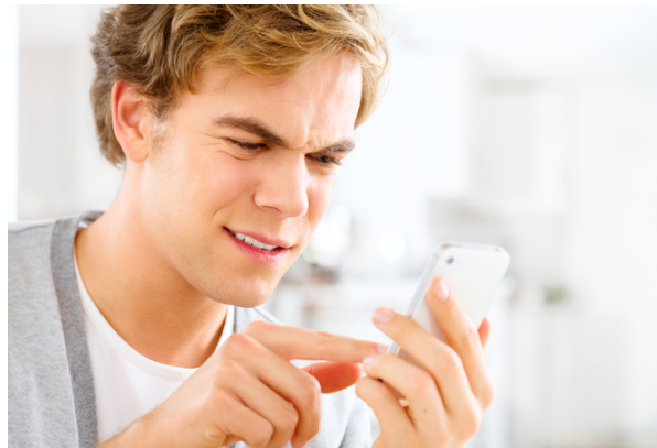
If information is everywhere, then how can we learn? Technology image from www.shutterstock.com

With so-called intelligent personal assistants becoming more sophisticated, it won't be long before we have the same kind of access to information as the characters from Star Trek: "Siri, at maximum warp how long will it take to reach the bar?"