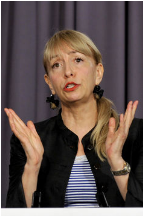
Baroness Susan Greenfield at the National Press Club in Canberra in 2010.

argument decades before the invention of Google. But it is taking time for this new reality to filter through to educational policy and to the classroom.