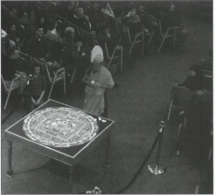
Fig. 3. Consecrating Mandala.

but depict an “imaginal world-patterning directly affecting inner structuring of physical and mental senses through . . . a world-picture reflecting the brain’s perception of its environment” (Thurman 2000, 143) that becomes imbued with a sacred presence. As the goal of Newtonian cartography is to depict an accurate representation of the observable material world, the mandala maker seeks to chart the nature of an “ultimate” world, utilizing a “cosmogrammar . . . of cultural representations” (Thurman 2000, 144).