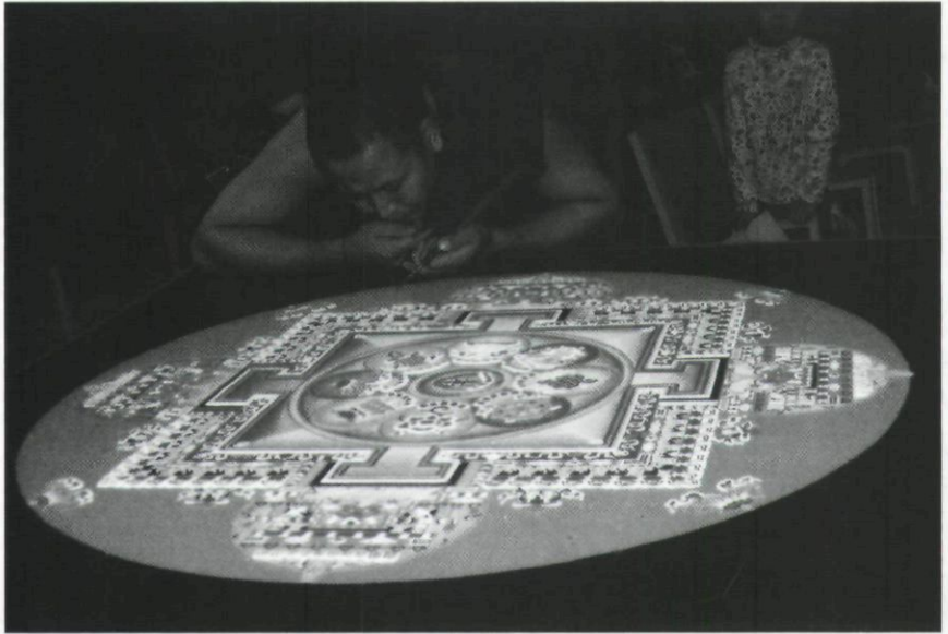
Fig. 2. Constructing Mandala.

ground where prepared visitors can experience heightened awareness and take significant strides in their understanding of the world outside and their inner nature (Bryant 1993; Zangpo 2001). Mandalas are representations. The real mandala relates to aspects of the mind, providing a metaphor to help transcend the perspective of ordinarily perceived existence.