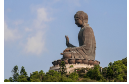
Figure 1: By Béria L. Rodríguez, CC BY-SA 3.0

Most Computer Scientists think " P \neq NP ". If that's true, then there is no correct, deterministic algorithm for any NP-complete problem that runs in polynomial time. 3 Specifically: if a problem is NP-complete, it's hopeless to write an algorithm that scales to arbitrarily large problem sizes and definitely, precisely solves every possible instance of those sizes correctly for exactly that problem.