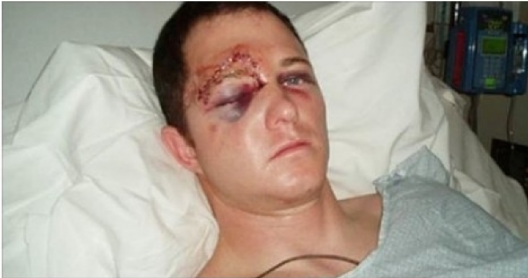
Photo Of Ferguson Police Officer Darren Wilson Following The Michael Brown Shooting (Unconfirmed) http://t.co/ZlcriPpFRv