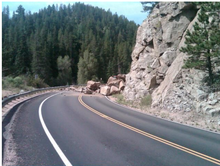
Figure 2: Rock fall from a steep roadcut.