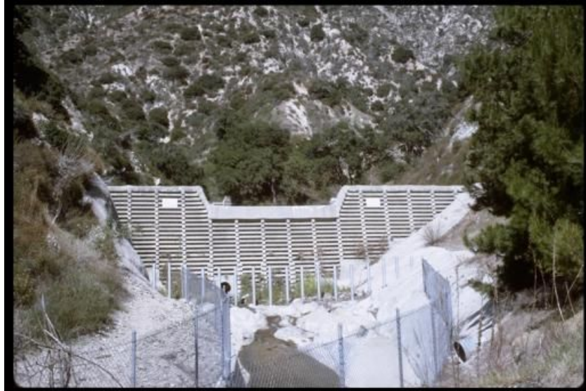
Figure 4: Debris flow catchment structure which stops large solids from passing, but allows water and fine sediment to travel downstream.