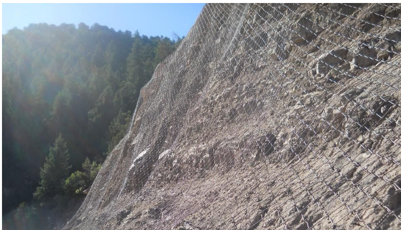
Figure 3: Rock fall netting used to capture large chunks of rock, and allowing them to pass safely to the base of the net.

The final maps produced delineate the areas along the sea to sky highway that, under our criteria, are at significant risk to future landslides. The only section of the highway that was found to be at risk through our analysis was a portion only slightly north of West Vancouver. These areas, depending on whether they are at the intersection of the highway and a roadcut, or the highway and a stream, should have protective measures emplaced. Areas deemed hazardous along roadcuts should have netting to catch falling rock and debris. Streams, which are most susceptible to debris flow events, should have catchment areas or underpasses which stop debris, or allow it move underneath the highway into the sound, respectively. Photos of these structures are highlighted in the photos below (Figures a and b).