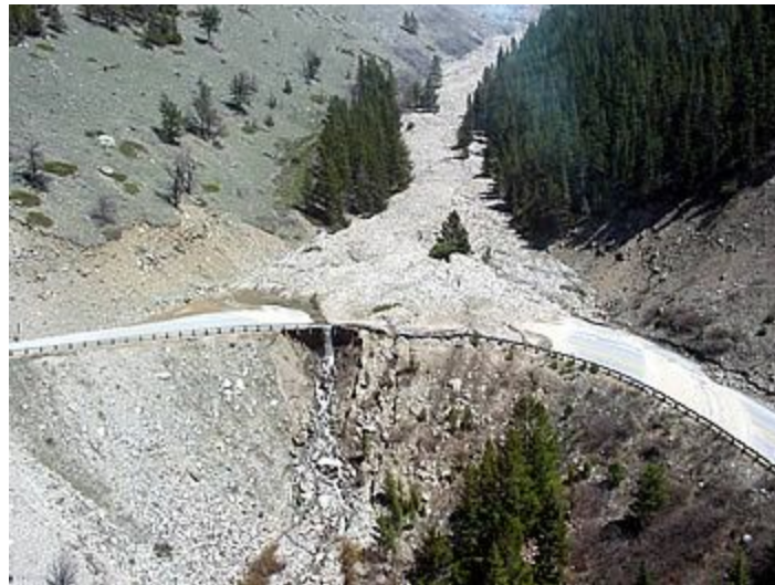
Figure 1: Channelized debris flow.