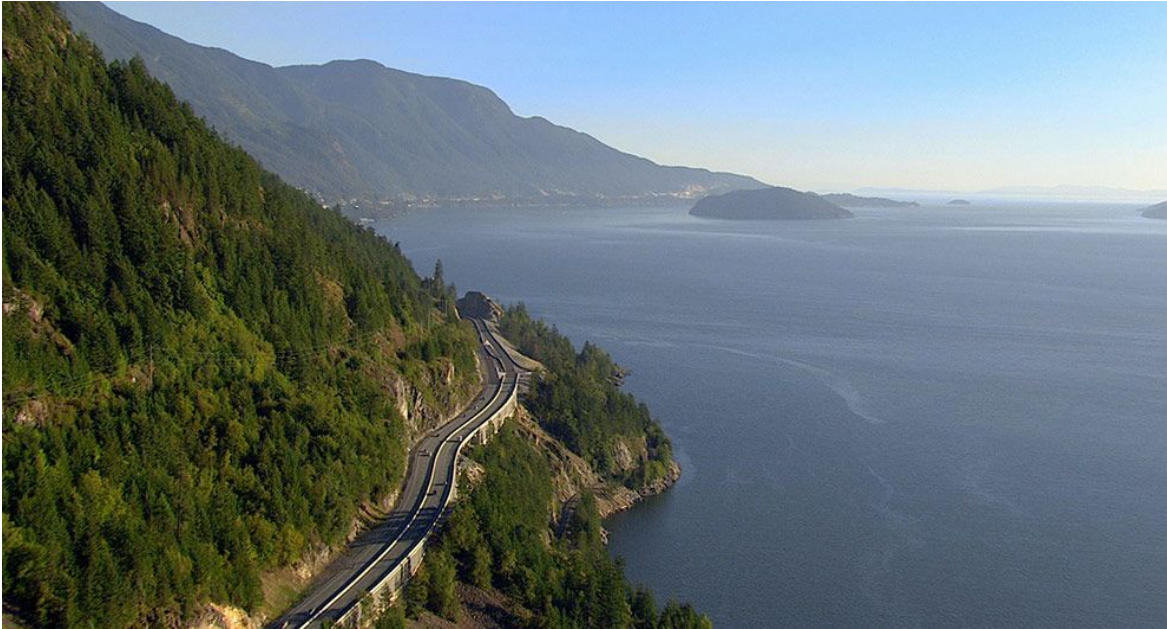
The Sea to Sky Highway, British Columbia, Canada

GEOB 270: Introduction to Geographic Information Science Final Project