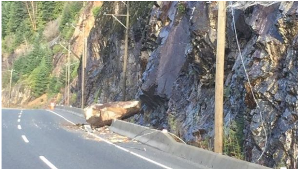
Rock slide on the Sea to Sky Highway