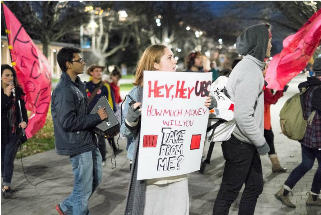
UBC Students protesting tuition increases and lack of financial assistance (2017)

In the span of nine years, the Faculty of Arts at the University of British Columbia Vancouver has grown 30% in overall size, while the distribution of financial aid to Arts students has remained relatively stagnant. According to a 2021 demographic study by the Planning and Institutional Research Office at the University of British Columbia, an estimated 16, 827 undergraduate students out of the university's total 31, 467 undergraduates were registered within the Arts faculty--totalling up to 53% of the university' total undergraduate population. (UBC PAIR, 2021)