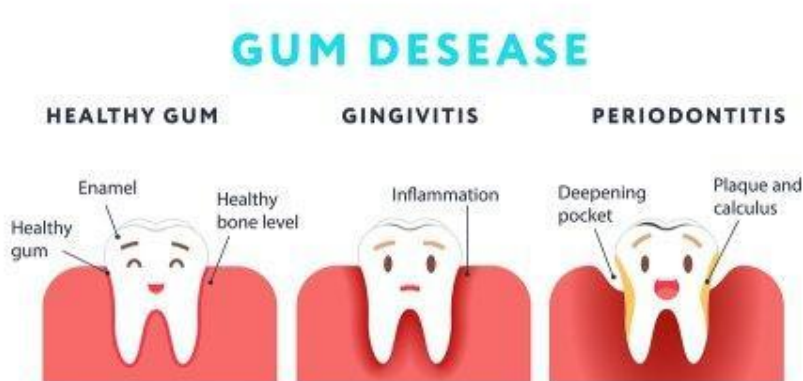
Figure 2: Comparison between Healthy Gum, Gingivitis and Periodontitis

Gingivitis is the earliest stage of gum disease. Improving your oral hygiene habits, such as more frequent brushing and flossing, can typically reverse it. Periodontitis is the second stage of gum disease, which occurs if gingivitis is not treated. Periodontitis is also considered to be an irreversible gum disease. With periodontitis, tooth roots and the bones in the jaw that support the teeth may be affected, which can lead to tooth loss. (Glenwood Premier, 2020)