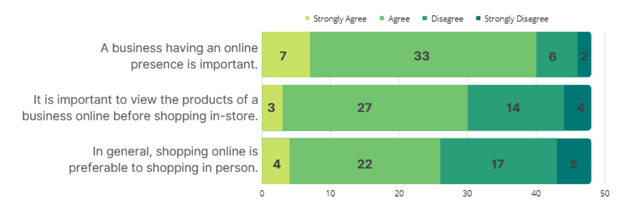
Figure 1. Website behaviour survey data

Figure 2 measures the frequency of behaviors related to website use. The majority of respondents (63%) at least sometimes sign up for newsletters (figure 2). While 52% of participants never call into a store to ensure product availability, there is still a significant portion that do (48%) (figure 2). Further, over 50% of participants said they visit stores that have no website, whereas 25% never do (figure 2).