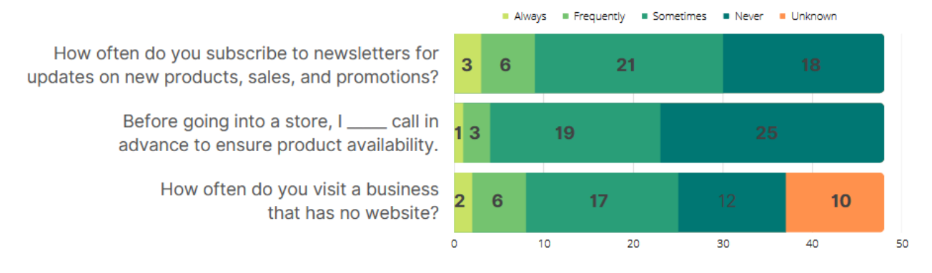
Figure 2. Website behaviour survey data

Figure 2 measures the frequency of behaviors related to website use. The majority of respondents (63%) at least sometimes sign up for newsletters (figure 2). While 52% of participants never call into a store to ensure product availability, there is still a significant portion that do (48%) (figure 2). Further, over 50% of participants said they visit stores that have no website, whereas 25% never do (figure 2).