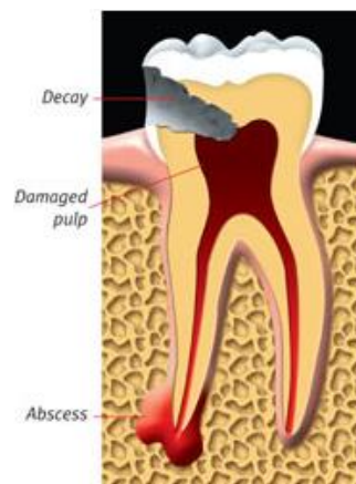
Figure 2. Infected tooth (CDA, 2020).