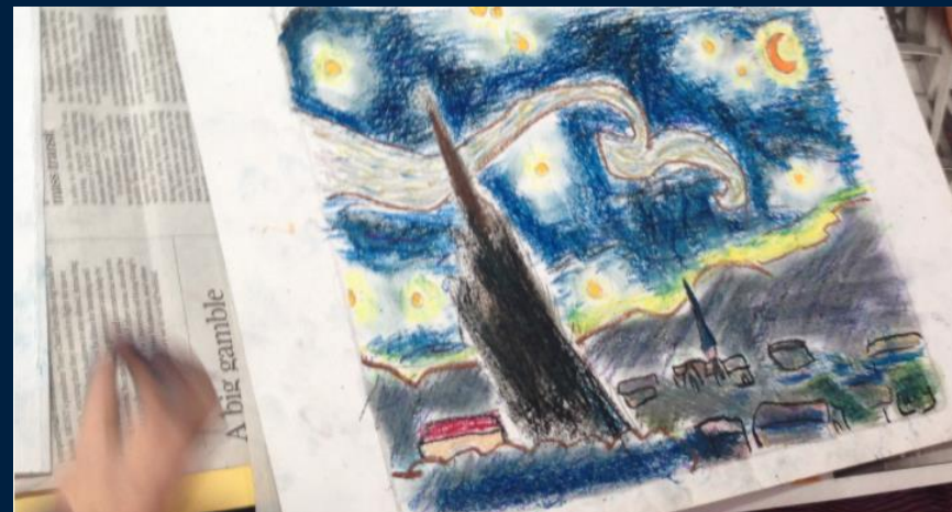
Student's Art Work Sha Tin Elementary Hong Kong