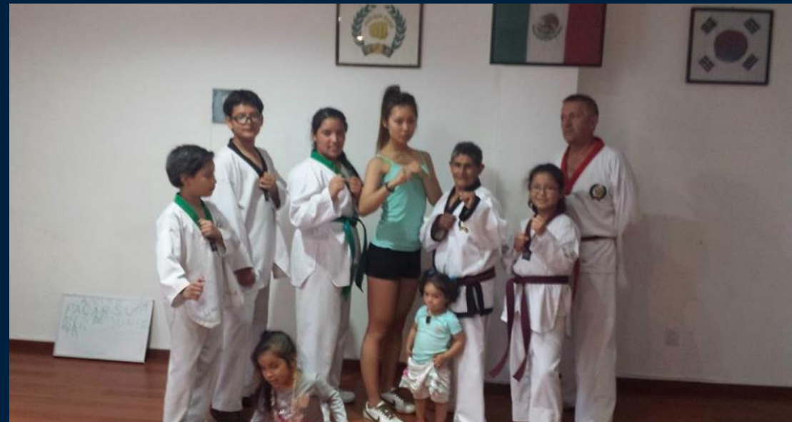
Working with the local Taekwondo class Zacatecas, Mexico

3 week field experience in a country outside of Canada's borders