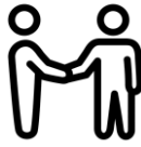
Virtual Introductions & Expectations