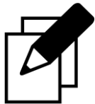
Lesson Basics: Assessments