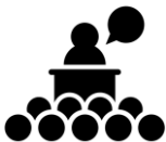
Teaching Large Classes