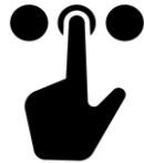
Choose Your Theme Sessions