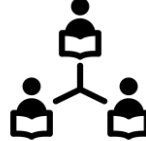
Lesson Basics: Learning Objectives