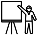
Plan Your First Mini Lesson