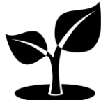
Applying Learning Theory