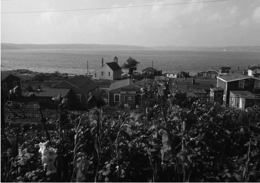
Source: Africville, ca. 1964.