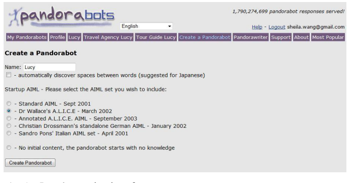
Fig. 4. Lucy's creation interface

English101 language learners are asked to interact with the commercial chatbot Lucy first. They are required to learn vocabulary, grammar and sentences in Lucy's world. Learners are then asked to communicate with Lucy online with the focus on reviewing vocabulary, grammar and sentences learned from Lucy's world.