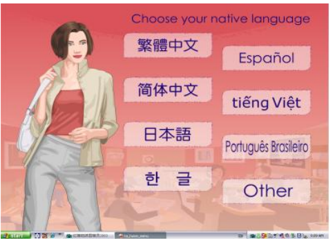
Fig. 2. Lucy's translation interface

When learners enter into Lucy's world, Lucy greets them and starts the conversation. If learners do not hear or understand what she says the first time, they can click on her to make her repeat.