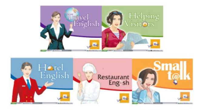
Fig. 1. Lucy's world

The commercial chatbot Lucy is a digital language tutor that can carry on extensive conversations with learners as they speak into their computers through a microphone. Using an advanced speech recognition system, Lucy can give learners feedback on their pronunciation and guide them through useful exercises to improve their pronunciation and accuracy. Lucy's world is where learners meet Lucy. In each world, Lucy offers users over 1000 sentences on a specific subject. Each of Lucy's worlds focuses on a different topic including helping visitors, hotel English, giving directions, English for traveling and restaurant English (Figure 1).