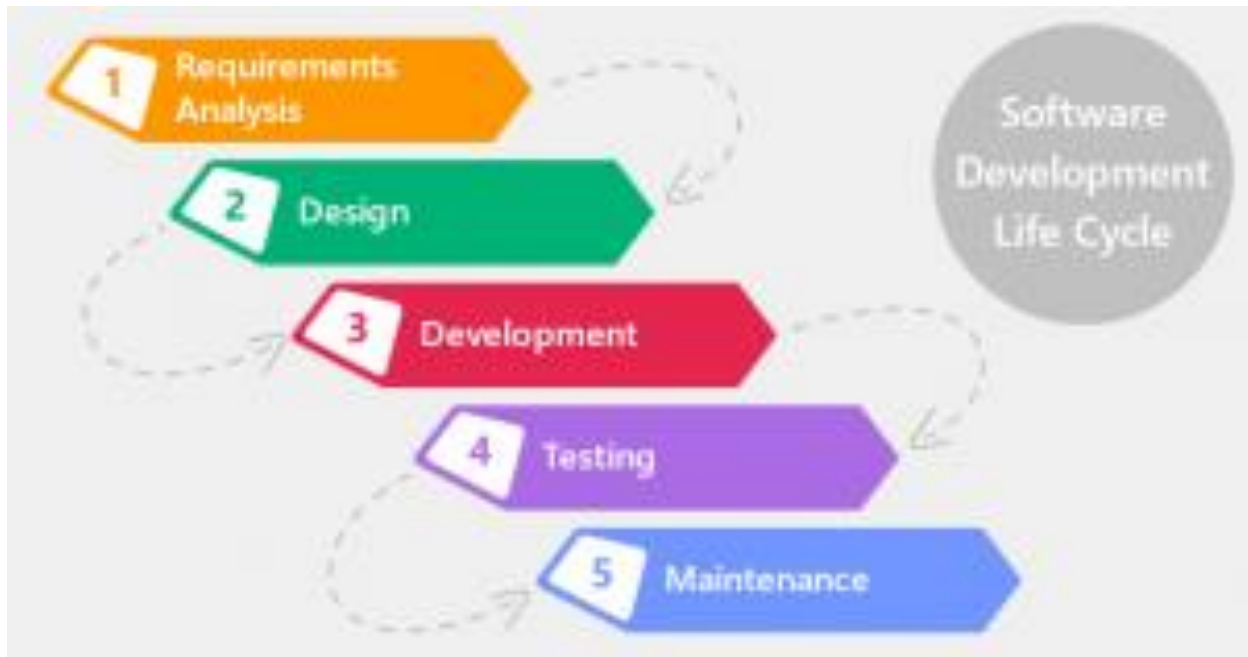
Figure 2 Description of The Waterfall Model