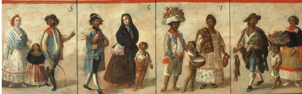
Mulato con Española, Morisco.