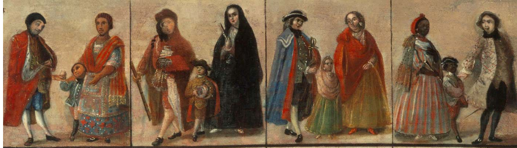
Español con India, Mestizo.