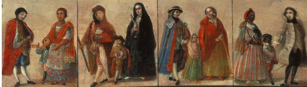
Español con India, Mestizo.