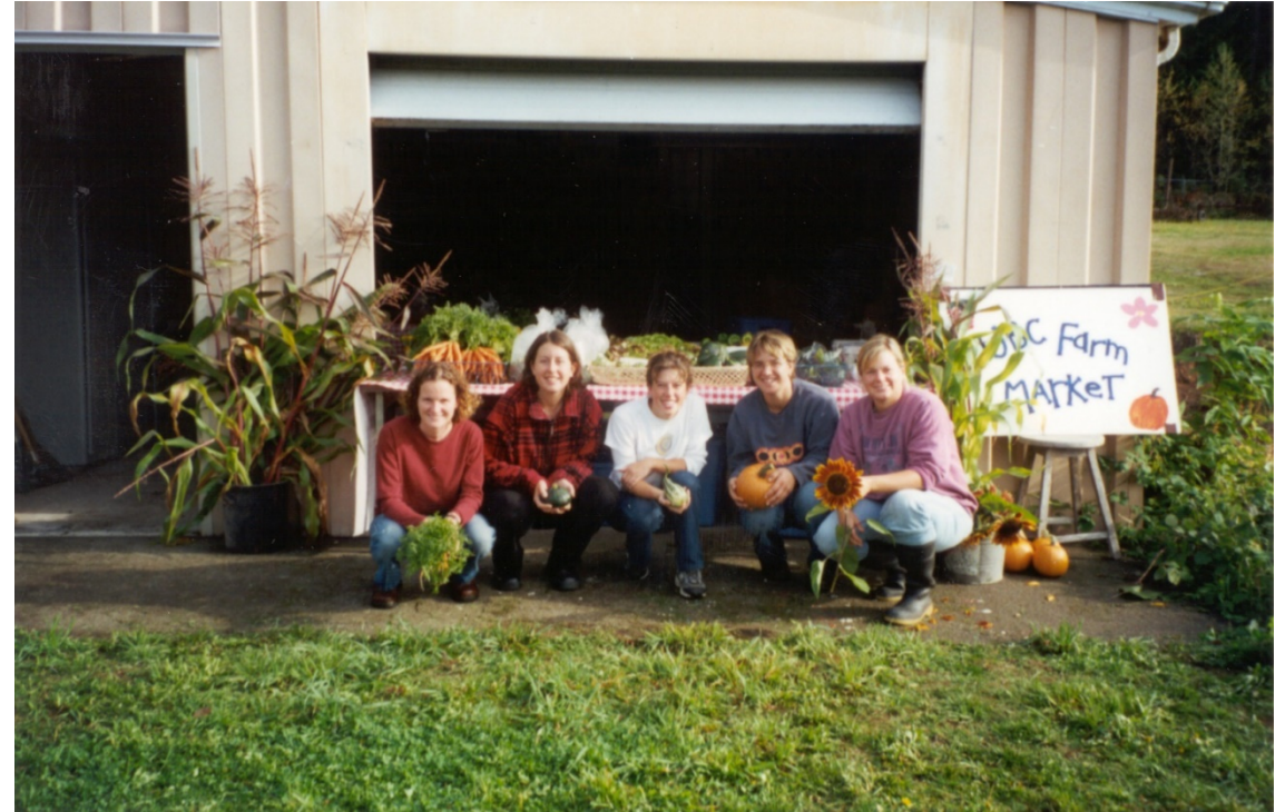
First UBC Farm Market 2001

Launching April 21, 2021 and continuing celebrations until end of November!