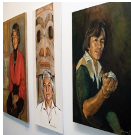
Chronicles of Pride at the Learning Centre Gallery.