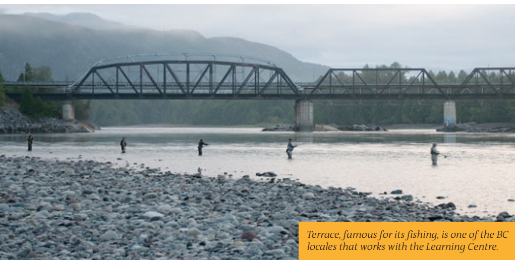
Terrace, famous for its fishing, is one of the BC locales that works with the Learning Centre.

The Learning Centre is dedicated to meaningful exchange with BC communities, as well as to making the intellectual life of this great campus accessible to a broader audience – in particular, to rural and remote communities.