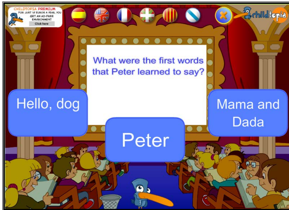
Figure 2: Example of post-reading comprehension question from ChildTopia™

Each story was also accompanied by a set of 10 follow-up comprehension questions that were mainly factual and read aloud using the same female narrator's voice (see Figure 2 for a sample screenshot). Independent readers, however, had the option of turning off the audio narration and read the stories and questions to themselves.