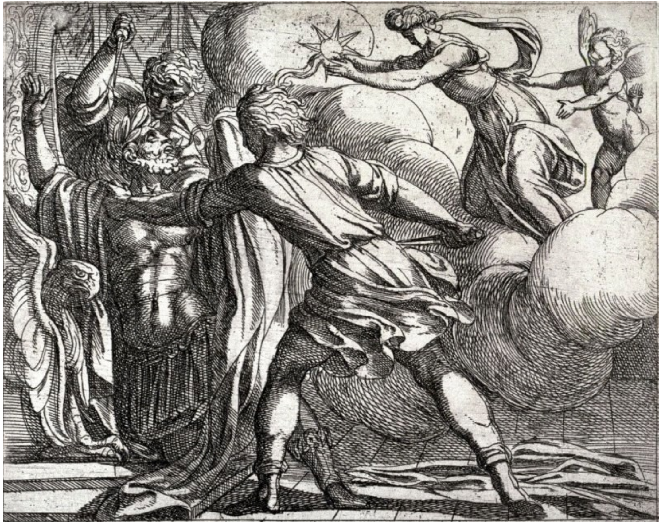
150. Iulius Cæsar Veneris beneficio in Cometam mutatur.