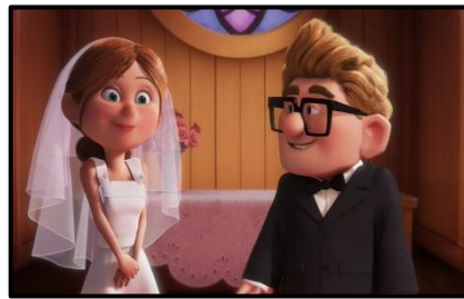
Figures 1a) and 1b)- images from a montage in Disney Pixar’s “UP”