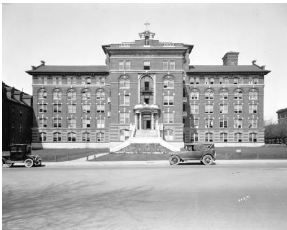
St. Paul's Hospital, Vancouver in 1935