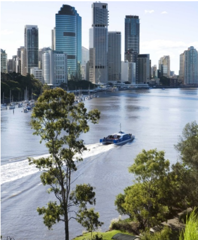
Brisbane - home of the 2014 G20 Leaders Summit

The G20 GBC is a multidisciplinary graduate business case competition to design sustainable solutions that incorporate innovative technologies and business models to address a global challenge.