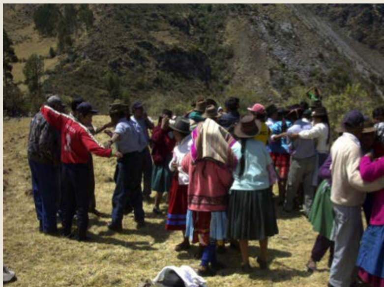
▲ Historical Memory Workshop in the Apurimac region of Perú.

First let us identify the psychosocial value of memory and its contribution to the processes of mourning and to the reconstruction of fragmented families and communities.