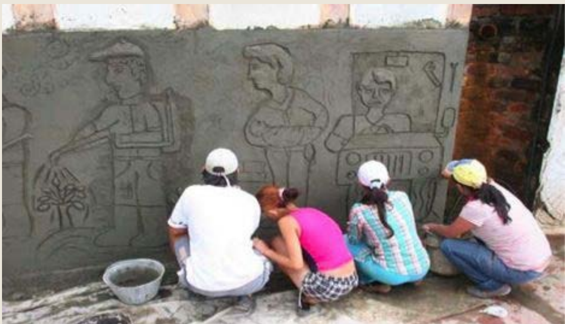
▲ Monument to the victims of the massacre of Trujillo, Valle, Colombia. Photo by Jesús A. Colorado, 2008

Historical memory interventions can promote the creation of respectful and safe spaces for people who wish to incorporate their stories into historical accounts.