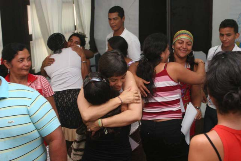
▲ Memory Workshop, Cartagena, Colombia 2009.