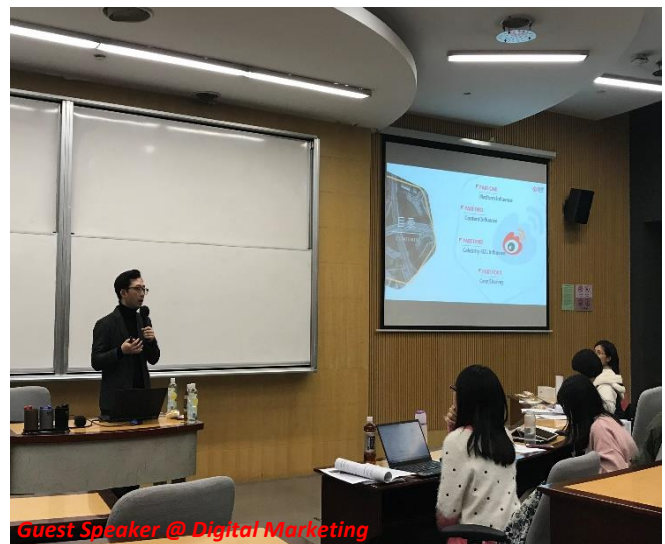
Guest Speaker @ Digital Marketing