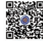
Dean School of Management, Fudan University

Amid unprecedented changes in a century and rejuvenation efforts of the Chinese nation, we will as always take up the mission of the times, and with an eye to the culture of China at large, make persistent efforts and explorations. We will train talents and contribute cutting-edge management ideas in support of China's economic growth. We will constantly innovate, and set the trend for management education in China and one day in the world, setting new milestones in Chinese management education, winning global praise and adding a new touch of brilliance in history books!