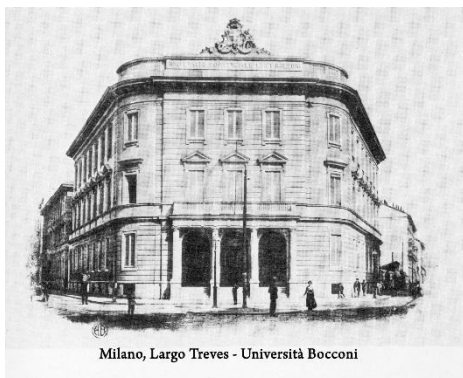
Bocconi in 1902