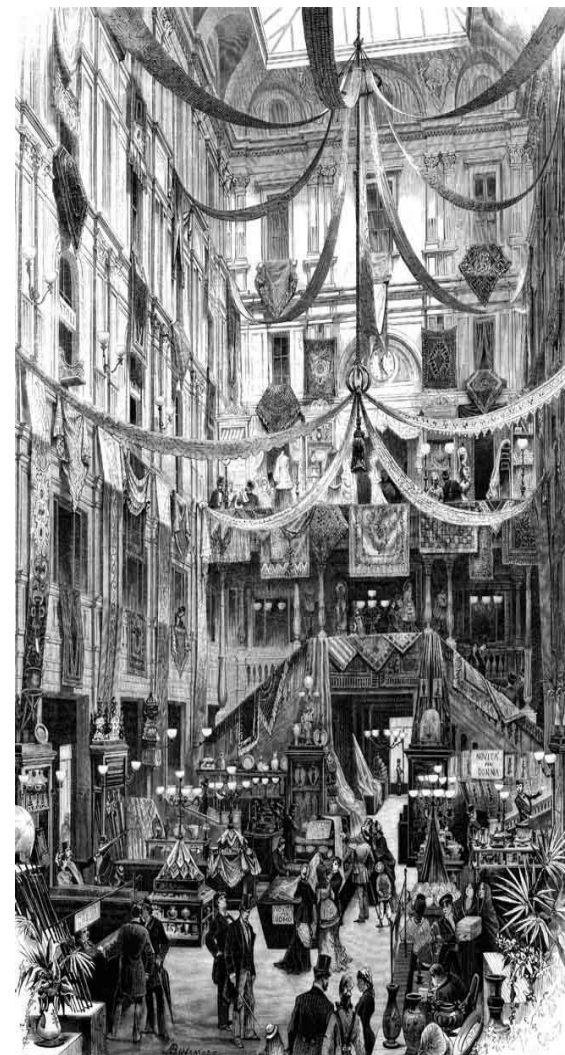
Magazzini "La Rinascente"