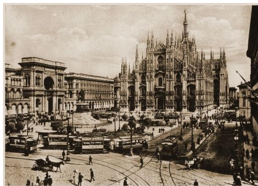
Milano Piazza Duomo - 1900

Università Commerciale L. Bocconi, founded in 1902 by the businessman Ferdinando Bocconi, was the first Italian University to grant a degree in Commerce .