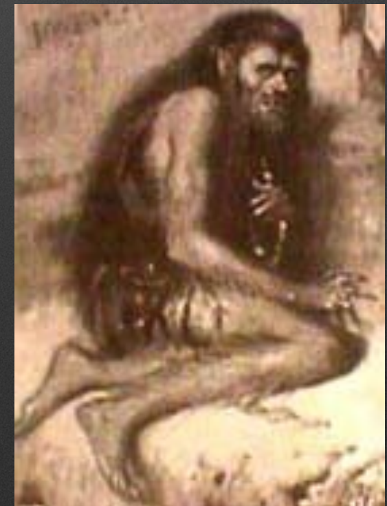
Beerbohm Tree, 1904