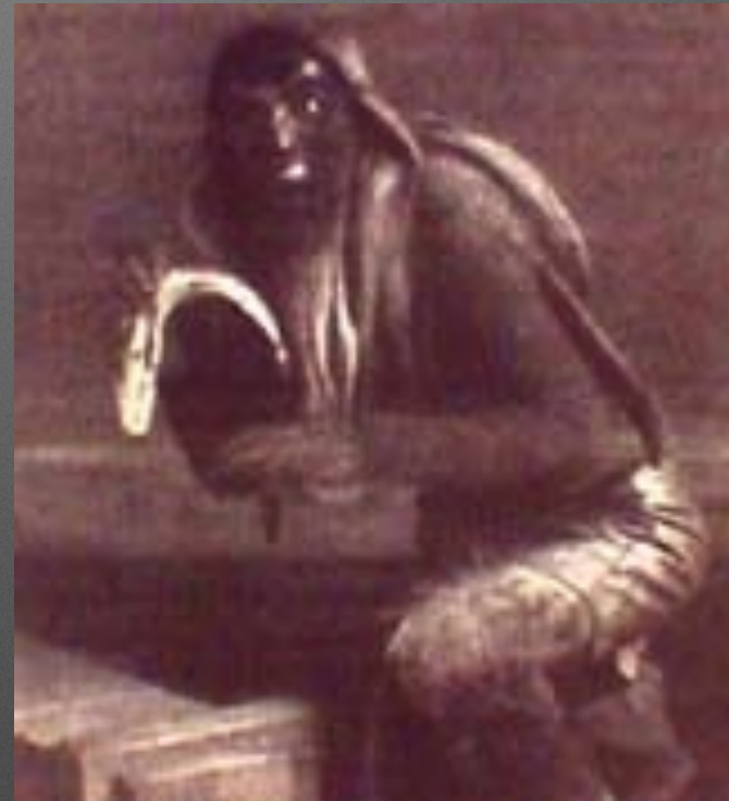
F. R. Benson, 1890s