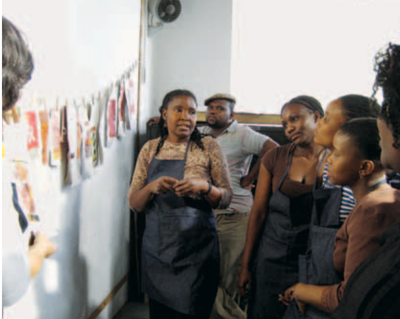
LEFT Collaging from fragments of prints pulled from the ashes, Bus Factory basement, Newtown, Johannesburg, 2003. RIGHT Discussing Paper Prayers, workshop with Phumani Paper representatives, APS, 2006.

Board of Advisors, receiving funding grants year by year. APS established the Paper Prayers Campaign in 1997, which took HIV/AIDS education around the country using printmaking. We also started making our own paper, which became a research project in my department at the University of Johannesburg and subsequently, building on the networks of Paper Prayers, Phumani Paper, a national poverty-alleviation programme funded by government to create new jobs around the country.