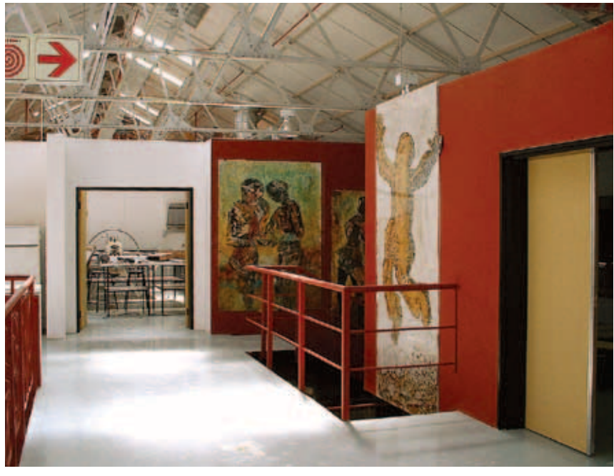
TOP The New APS, Newtown, Johannesburg, 2004. BOTTOM Street printing with a steamfoller, Jeppe Street, Newtown, Arts Alive Festival, 1993.

We have had successful artists in residence, international artists and educators coming to teach, and have promoted exchanges with printmaking and papermaking studios around the world. We have hosted tourist groups, guest workshops, seminars, overseas internships, research projects and social advocacy campaigns. Our student body has expanded through the accredited training qualifications, skills certificates, our three-year training programme and post-graduate internships and assistantships. APS students