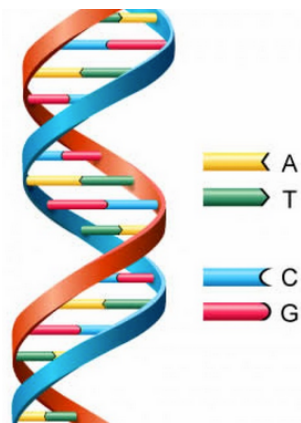
Figure 1. DNA double helix with complementary base pairing visual. (Tfscientist, 2011).

Complementary base pairing: Due to the chemical structure of DNA, base adenine (A) always pairs with base thymine (T) and base guanine (G) always pairs with base cytosine (C). Therefore, if the sequence of bases is known on one strand, the sequence of bases on the complementary strand is easily deduced through complementary base pairing.