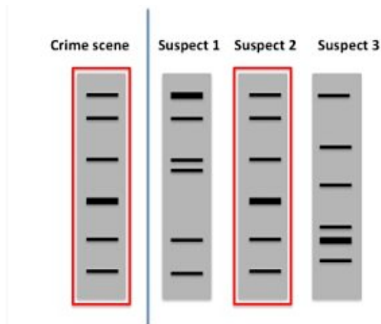
Figure 3. Diagram comparing STR regions between 3 suspects and the crime scene. (Kie, 2014).

individual has unique STR (Short Tandem Repeats – short segments of DNA four to five base pairs long that are repeated multiple times in a row), forensic scientists are able attach dyes to the STR copies of the amplified DNA to visualize length of each STR and use that as a basis of comparison. In criminal investigations, thirteen STR regions are analyzed for their length, and thus when all thirteen STR regions match with suspect, you've got your culprit. For example, in figure 3, it is clear that the banding pattern for suspect two matches the crime scene DNA sample. Other applications of PCR include paternity testing, infection detection, and disease detection.