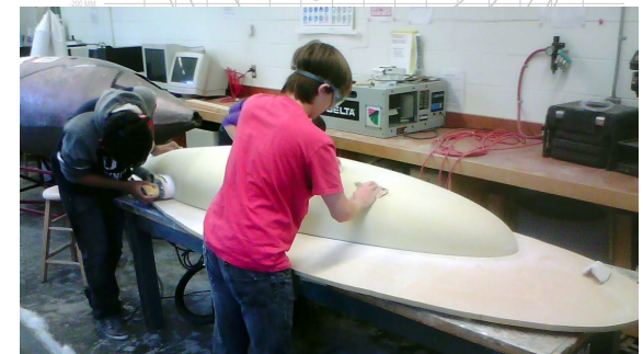
Above, team members sand the plug for the most recent competition hull. The plug was CNC cut from foam and coated in a durable plastic compound. This was used to make a fiberglass mold for the hull.

Email: subc_abc@hotmail.ca Website: blogs.ubc.ca/subc/ Facebook: www.facebook.com/ubc.submarine