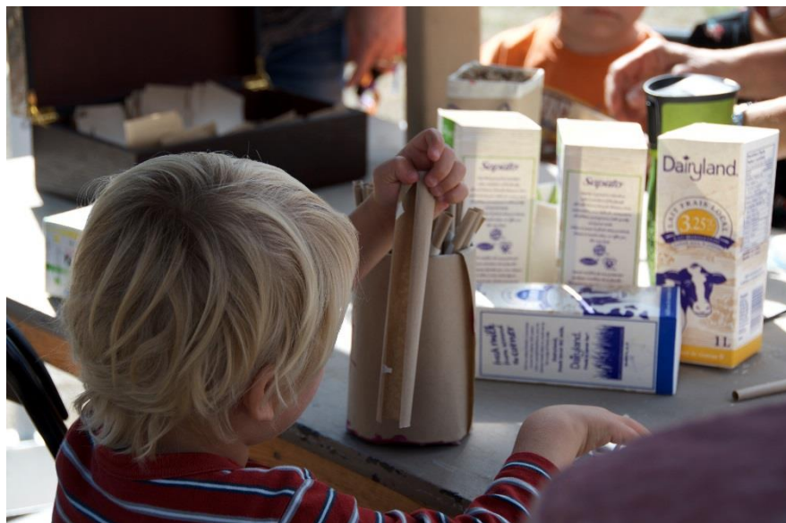
Making the tubes to put in the Mason Bee Homes- made from milk cartons.