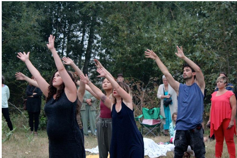
Movement makers, or Performers