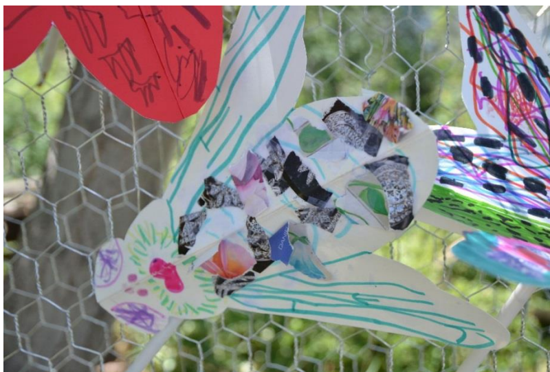
Bees hanging on “Swarm”