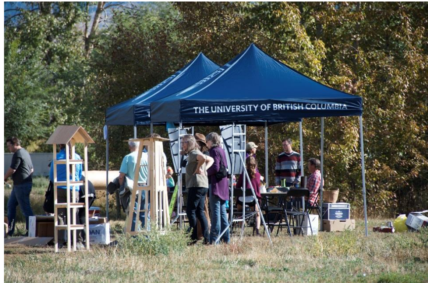
The site of the projects with empty insect hotels ready to be filled.