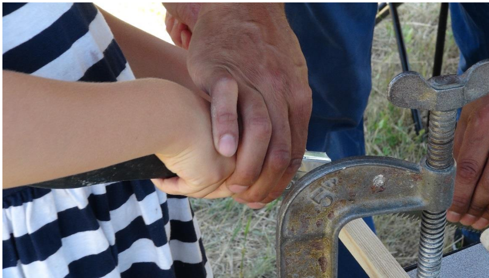
Two photos of people using the popular handheld “pencil sharpener” tool!