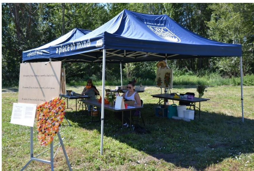
The Decorating Tent