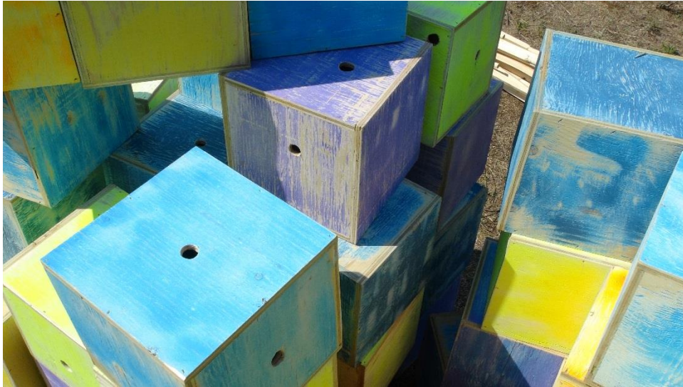
The Coloured Boxes- painted the colours bees see