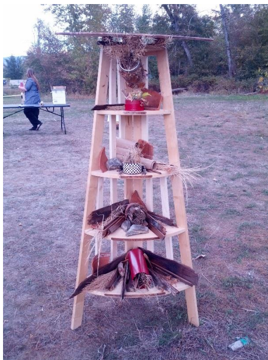
A beautiful insect hotel at the day's end.