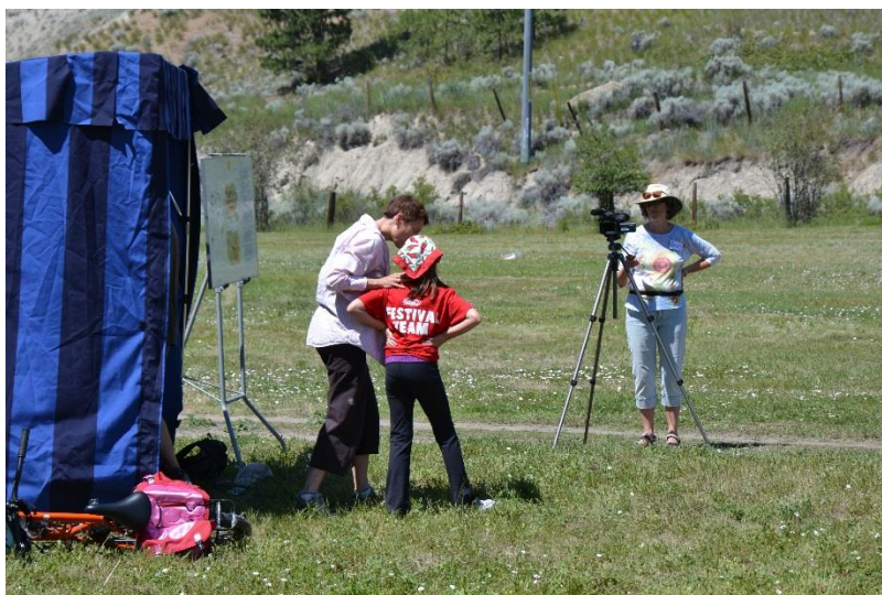
Bee Dance being filmed