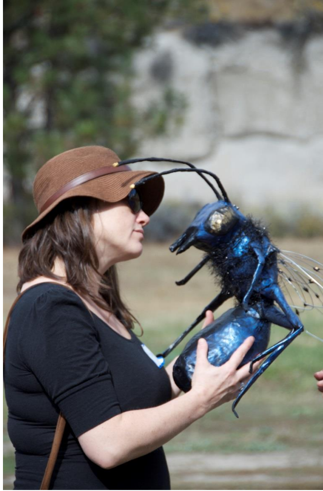
The fabulous paper mache mason bee from the tube, seen below: