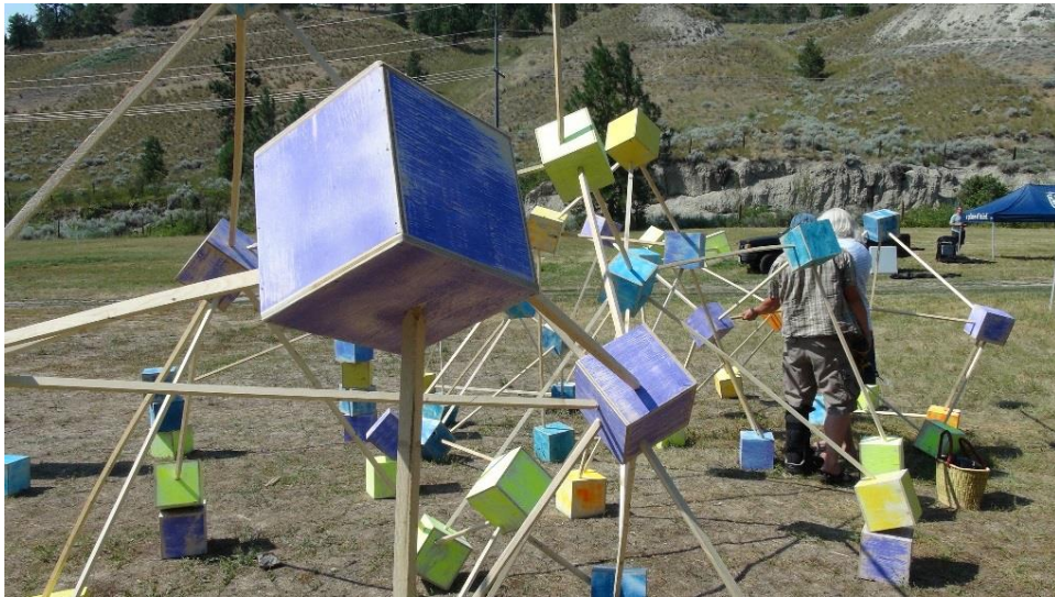
As the sculpture was built it got more amazing and beautiful!