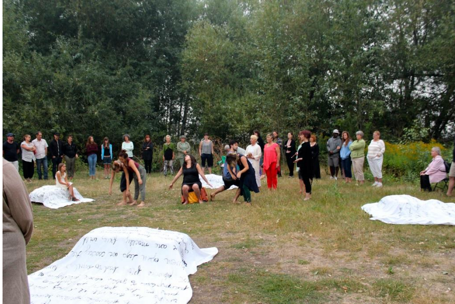
Audience encircling performers, poetic texts draped on ground.