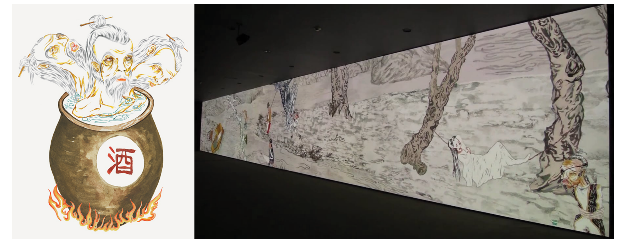
Key Frame (right) and Installation (left) of Retainers of Anarchy (2017) at the Vancouver Art Gallery